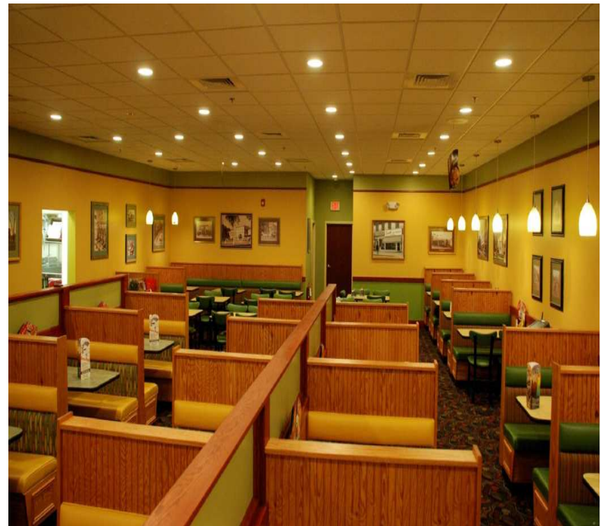
LR6 – 12 Watts – Par 38 948 watts