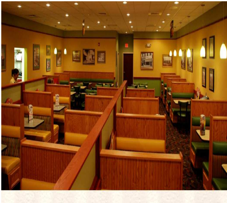
Incandescent 65W - 5,135 watts